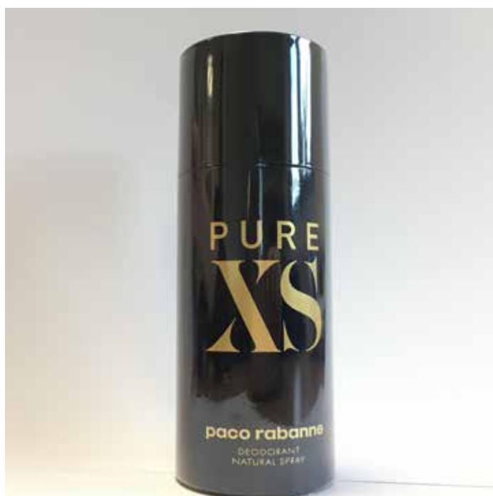
Auction Code 010

To bid for an item in the catalogue, simply email: auction@stanborough.herts.sch.uk and tell us how much you are willing to bid for the item.