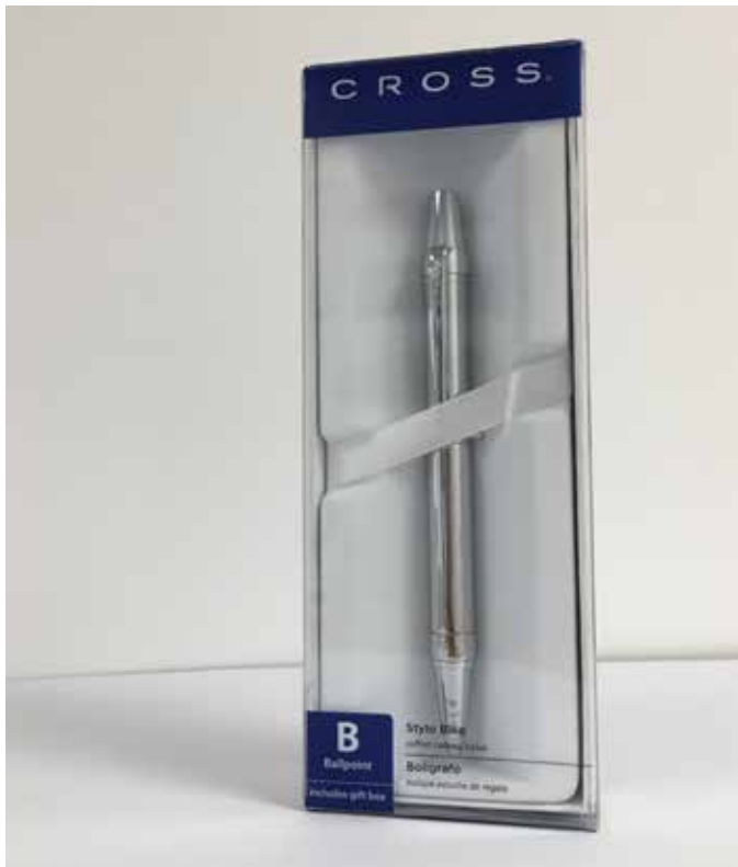
Auction Code 005