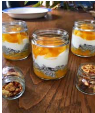
Auction Code 021