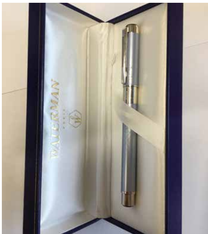
Auction Code 007