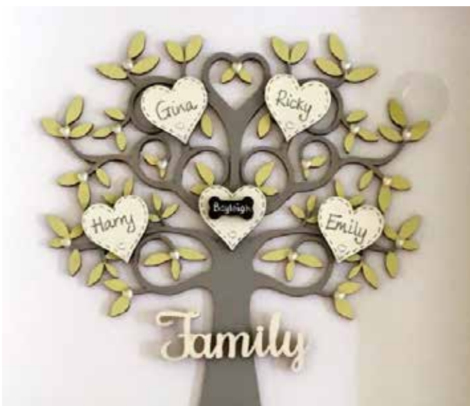
Auction Code 022

Kindly Donated by Handmade from the Heart Visit the facebook page.