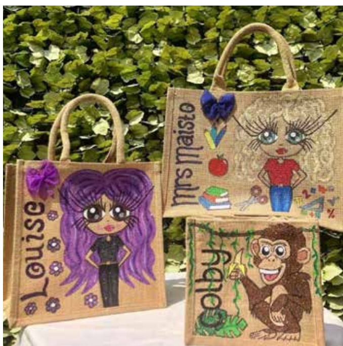
Auction Code 008