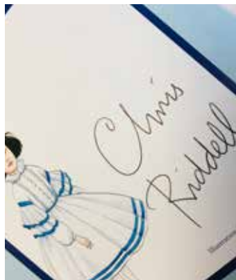
Auction Code 001