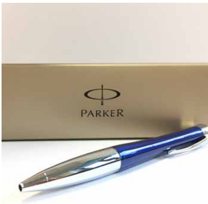
Auction Code 006