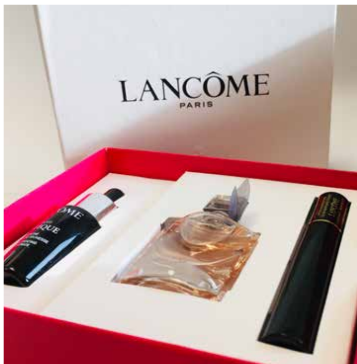
Auction Code 009