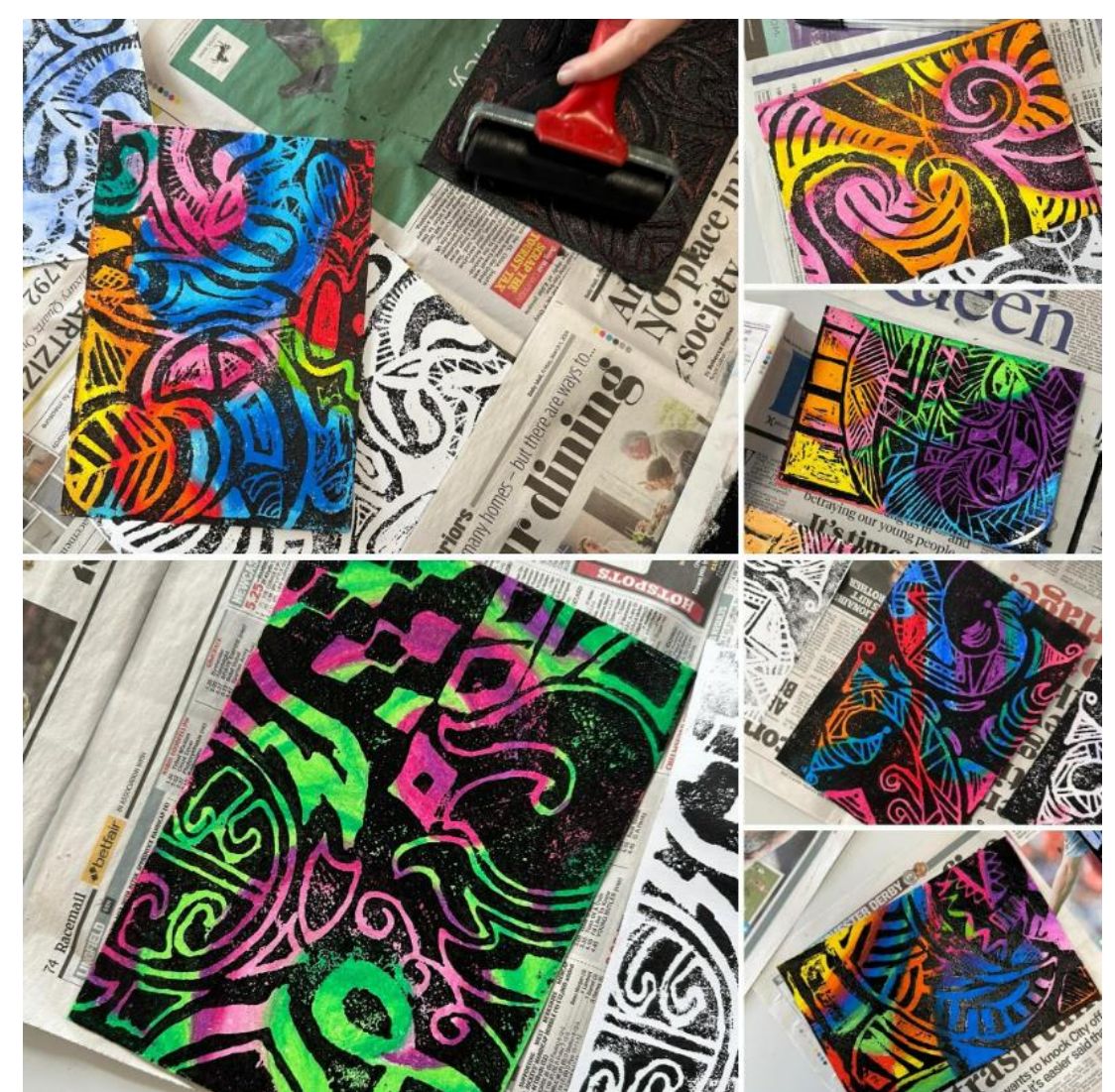
Some stunning Ta Moko inspired prints by Year 8